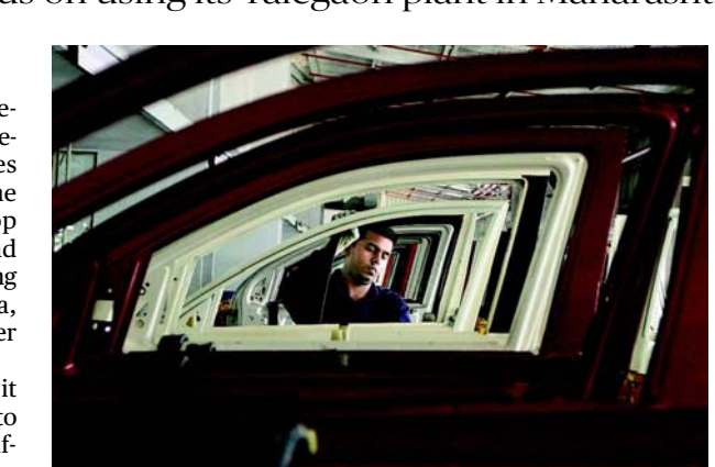
Curtain call: GM shut its plant at Halol, in Gujarat, last month and transferred some workers to Talegaon.

"The decision [to focus on exports and to cease domestic sales], which follows a comprehensive review of future product plans for GM India, is part of a series of actions taken by General Motors to address the perform-