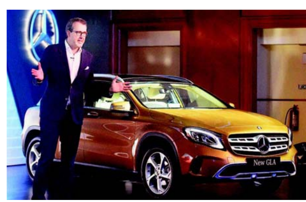
Plush sedan: The price of the 2-litre petrol model of Class d 200 begins from ₹30.65 lakh.

growth this year will be the E-class that we launched in March. E-class will be our best selling model, we can say for sure because recention has been extremely