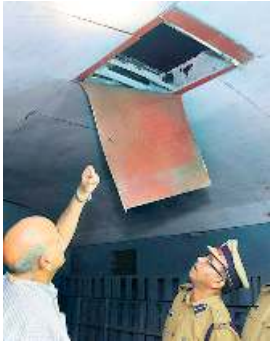
The notorious gang was involved in several grave crimes in north India, a CB-CID official said.

clear technical evidence which confirms their involvement. While analysing suspicious mobile phone numbers that were active at the Salem junction and along the route between Salem and Villupuram, we found certain similarities between some numbers. The users were from Madhya Pradesh and belonged to the same locality there. Enquiries revealed that the notorious gang was involved in several grave crimes in north India," a CB-CID official said, adding that the gang operated on the roof and inside the coach all along since armed guards of the Salem city police escorting the train inspected the parcel van at all scheduled stoppages.