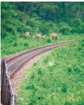
Phone camera image shows the animals after they crossed the track.

The elephants, barely 250 metres away from the locomotive, had taken time because of three adventurous calves. "We waited a little more than 10 minutes for them to cross and disappear into the trees," the loco pilot said. The passenger train,