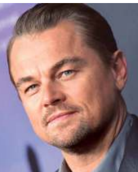
Several people thanked Leonardo DiCaprio for his concern.

Interestingly, Mr. DiCaprio, probably known best for his role in the Oscar-winning Titanic , and himself an Academy award winner, has taken on the