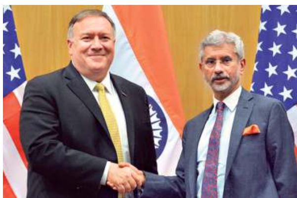
U.S. Secretary of State Mike Pompeo with External Affairs Minister S. Jaishankar in New Delhi. ■ R.V. MOORTHY

"If you trade with somebody, and particularly if they are your biggest trading partners, it's impossible that you don't have trade issues. But I think the sign of a mature relationship is that ability to negotiate your way through that and find com-