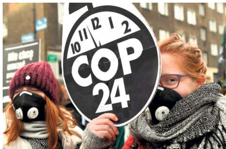
"COP-24 brings little cheer on the climate front for developing countries." Protesters on the sidelines of the summit in Katowice, Poland.

The reporting requirements are also marked by a pseudo-scientific concern for stringency, which is far in excess of the accuracy of climate